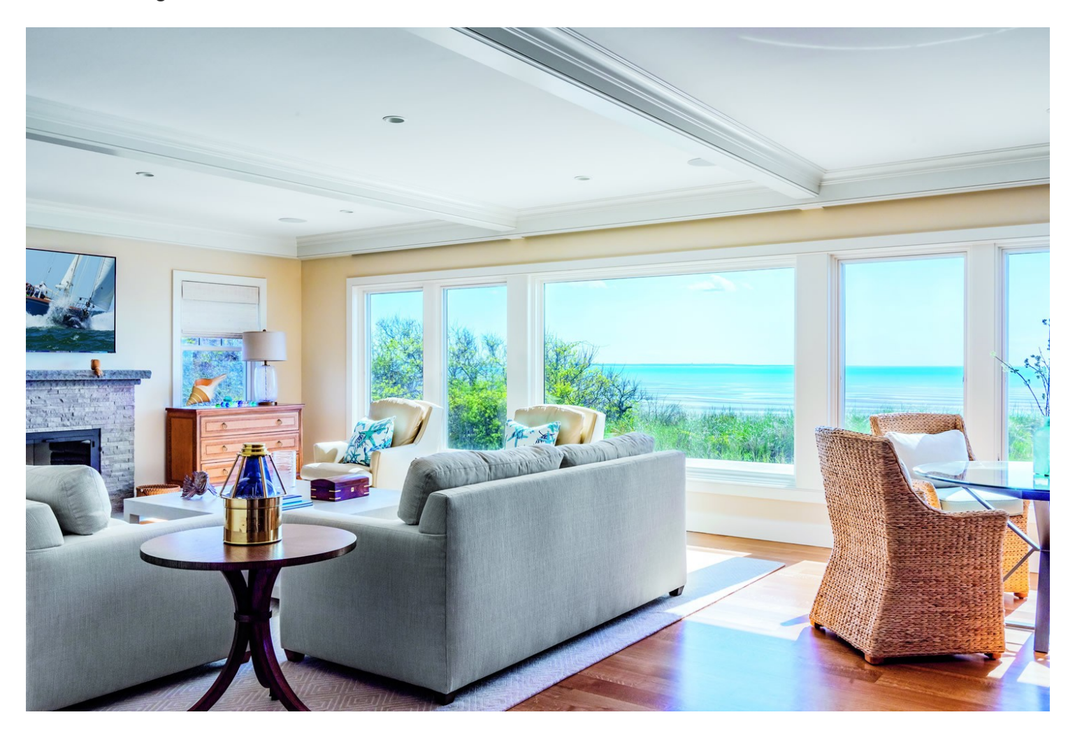
Shepley Wood used the A Series by Andersen to meet both the architectural aesthetic and the coastal product performance necessary.

Though this classic summer cottage, created in the Shingle Style tradition, doesn't read as an updside down home, inside is another matter. It is equipped with an oil-rubber elevator, and heavy in detail, gentle curves and finish carpentry-grade work, maintains owner Paul van Steensel of Cape Dreams Building & Design. The layout extends as wide as the lot allows, with as many rooms as possible facing the water, generous windows and gliding doors. "Every opening was discussed individually," explains Craig Fischer of Shepley Showcase, for its own merits as well as its contribution to the whole. Large casements and coastal performance-grade picture units were selected throughout, affording "unobstructed views of the natural coastal setting," he continues.